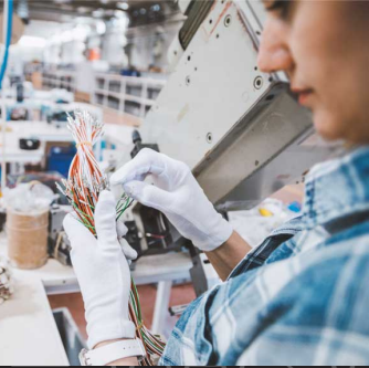
*Subject to Change on Raw Material Availability

Our factory partners specialize in your solution.